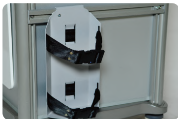
Oxygen tank holder