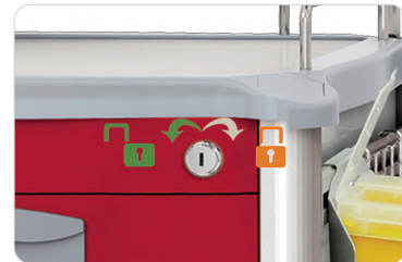
Central locking for drawers