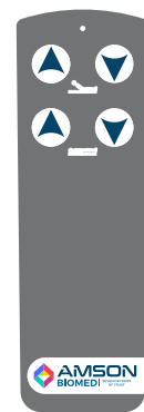
H4 for Elite-PY