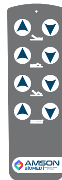
H3 for Elite-PX

*Battery backup is an optional accessory