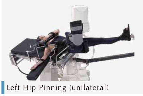
Left Hip Pinning (unilateral)