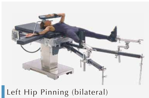
Left Hip Pinning (bilateral)