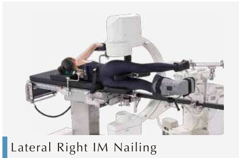
Lateral Right IM Nailing