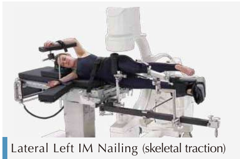
Lateral Left IM Nailing (skeletal traction)