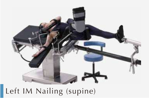
Left IM Nailing (supine)