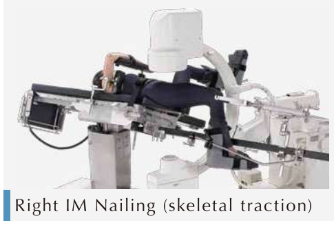
Right IM Nailing (skeletal traction)