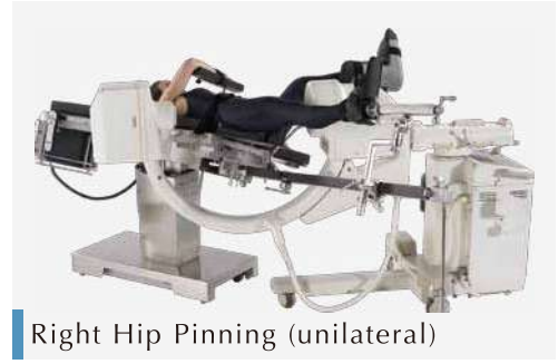
Right Hip Pinning (unilateral)