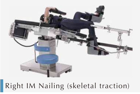
Right IM Nailing (skeletal traction)