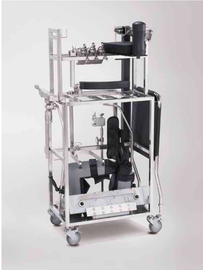
ACC0061 FOR USE WITH T1000 SERIES