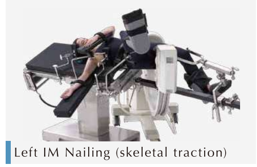
Left IM Nailing (skeletal traction)