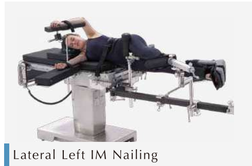
Lateral Left IM Nailing