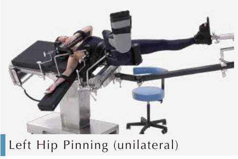
Left Hip Pinning (unilateral)