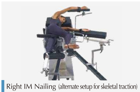
Right IM Nailing (alternate setup for skeletal traction)