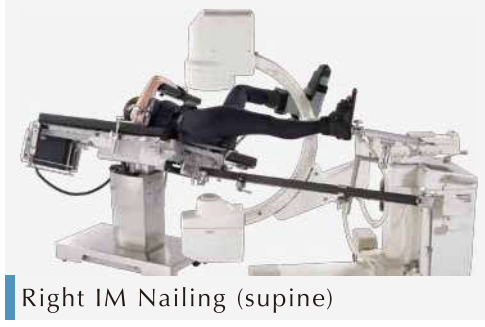
Right IM Nailing (supine)