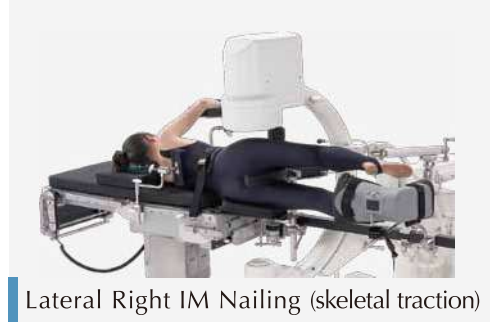
Lateral Right IM Nailing (skeletal traction)