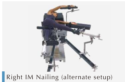
Right IM Nailing (alternate setup)