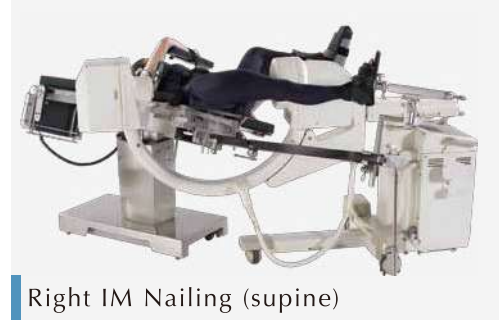
Right IM Nailing (supine)