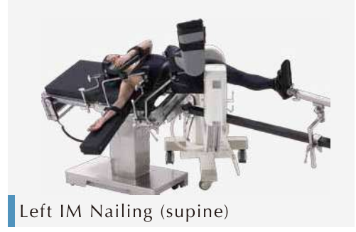
Left IM Nailing (supine)