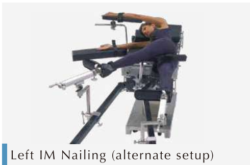
Left IM Nailing (alternate setup)