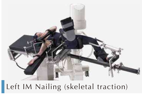
Left IM Nailing (skeletal traction)