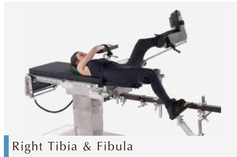
Right Tibia & Fibula