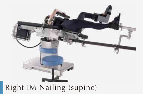
Right IM Nailing (supine)