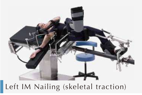
Left IM Nailing (skeletal traction)