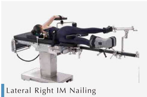
Lateral Right IM Nailing