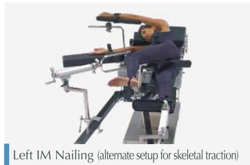
Left IM Nailing (alternate setup for skeletal traction)