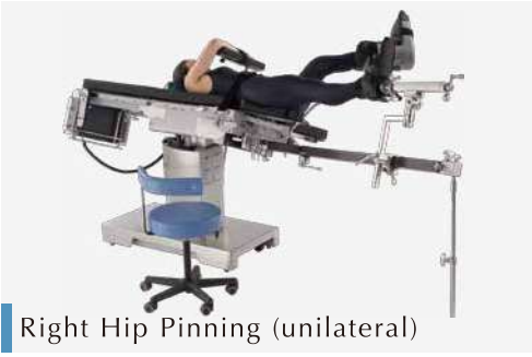
Right Hip Pinning (unilateral)