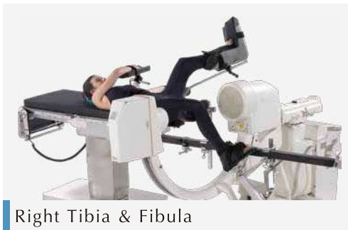
Right Tibia & Fibula