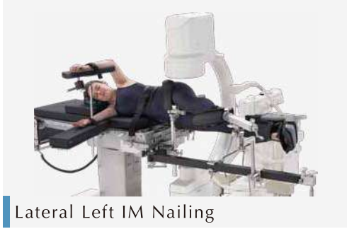
Lateral Left IM Nailing