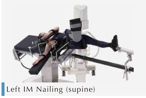
Left IM Nailing (supine)