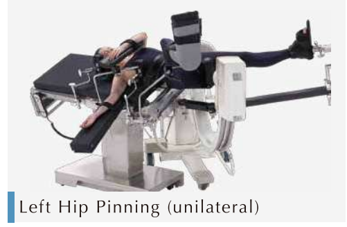
Left Hip Pinning (unilateral)