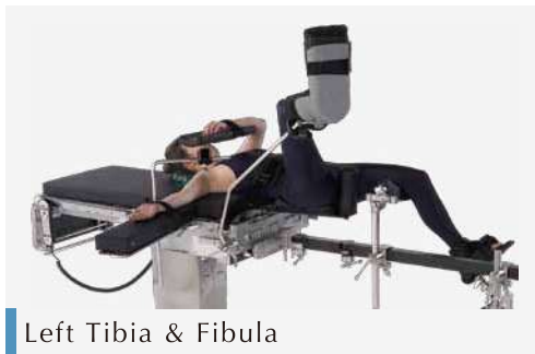
Left Tibia & Fibula