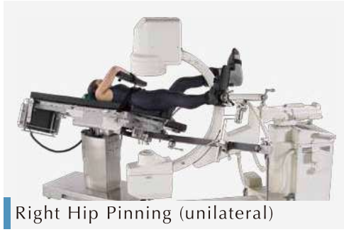
Right Hip Pinning (unilateral)