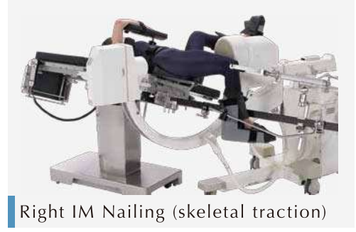
Right IM Nailing (skeletal traction)