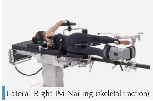
Lateral Right IM Nailing (skeletal traction)