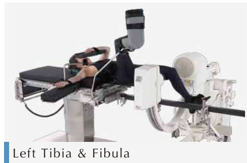
Left Tibia & Fibula